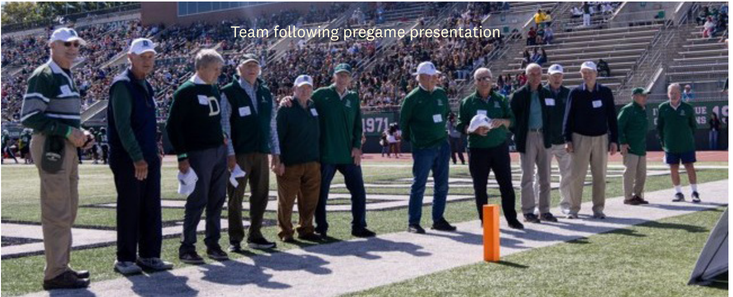
Team following pregame presentation