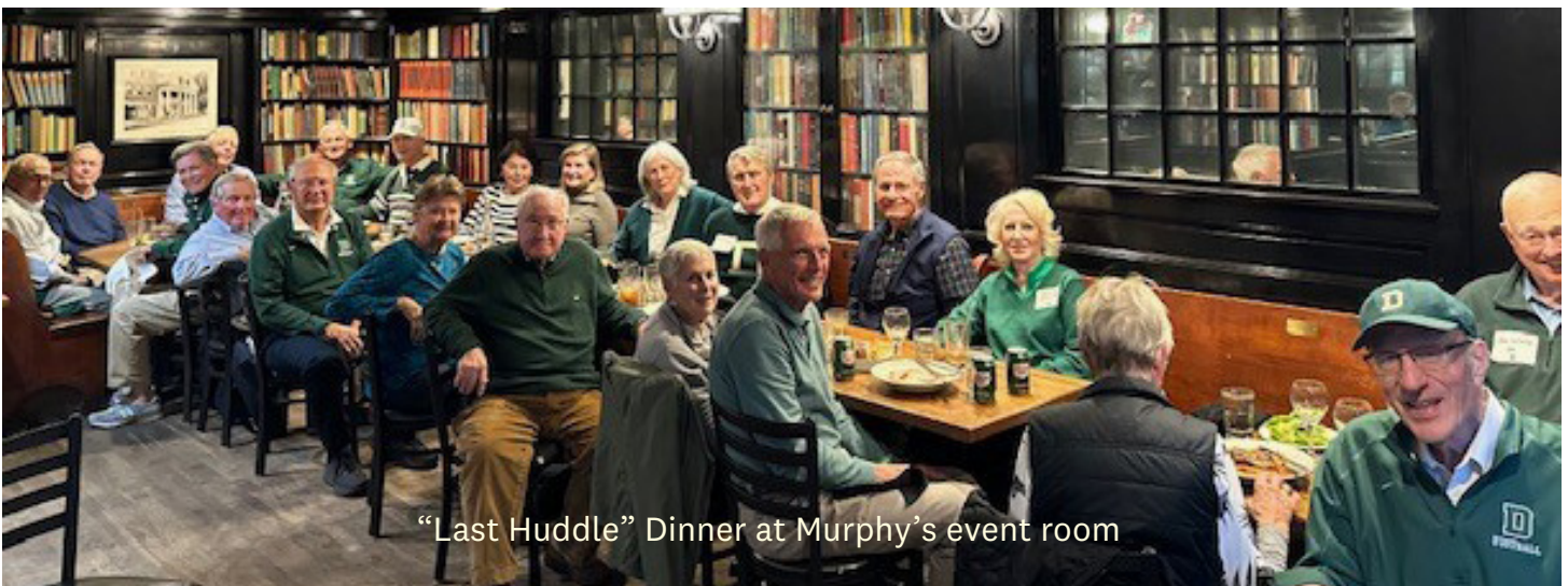
"Last Huddle" Dinner at Murphy's event room