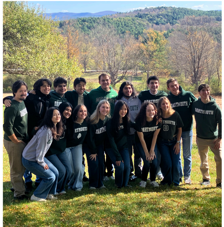
The Dartmouth Sings a cappella singing group

P.O. Box 416, Hanover, NH 03755 | pineparkassoc@gmail.com | pinepark.org