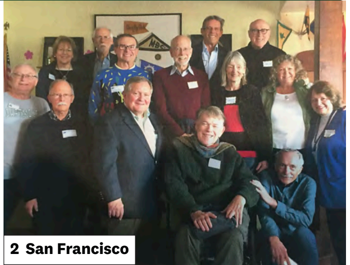
2 San Francisco