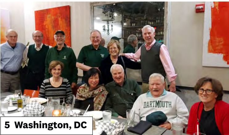
5 Washington, DC