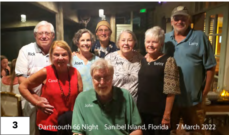
3 Dartmouth 66 Night Sanibel Island, Florida 7 March 2022