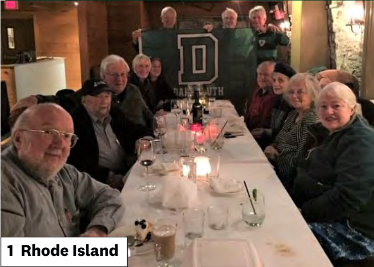
1 Rhode Island