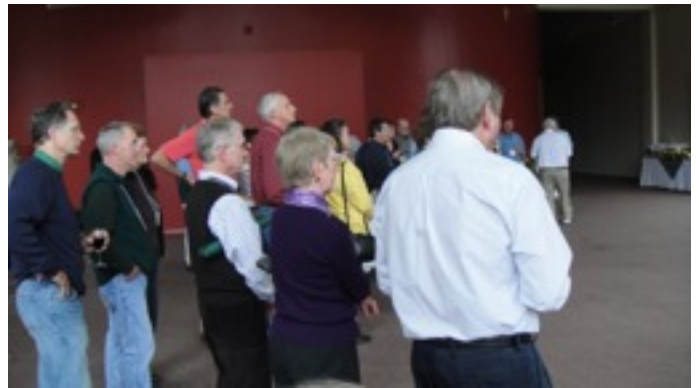
Friday Afternoon Reception