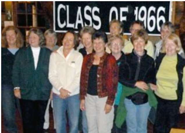
Wives at Ravine Lodge