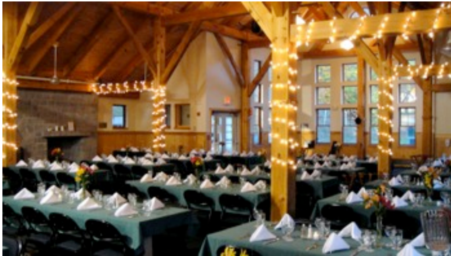
Sunday Night Dinner at the Skiway

cause it let people rekindle old friendships and make new ones; drew some classmates back to campus for their first reunion ever; provided a look at the College in full session; and prompted trips north for fall color. The critiques will help the new reunion committee make our next one even better -- so plan to be in Hanover in June, 2016, when we lead the graduation procession across the Green in celebration of our 50 years in the wide, wide world!