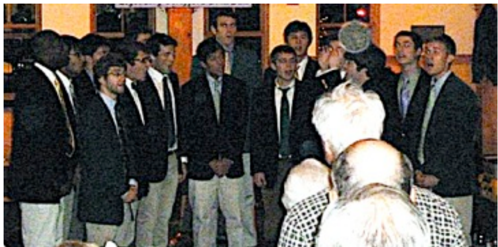
The Dartmouth Aires entertained on Sunday Evening