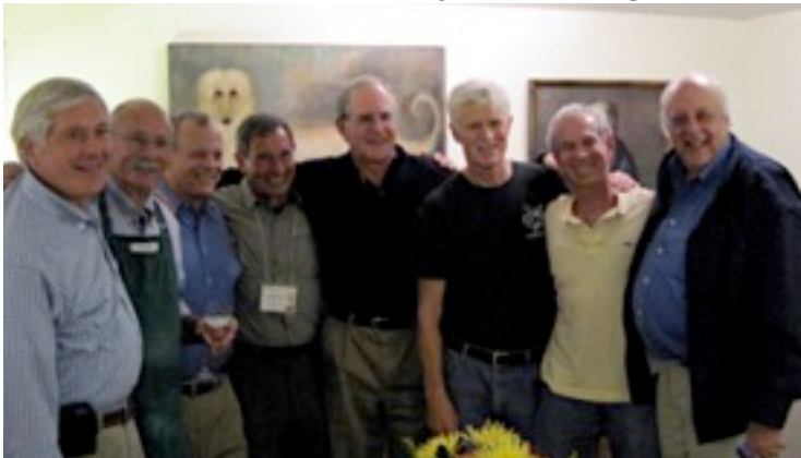
The Gang's All Here